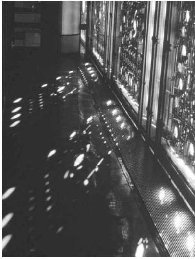
Arab Institute: Elevation (Left) with oculi; (Right) Interior with moving light patterns.