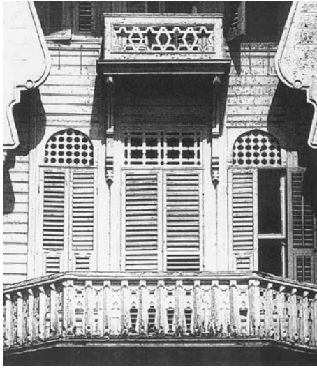
Turkish Shutters and Jalousie. (Photos by Venturi and Hellier in Splendors of Istanbul by Hellier 1993, 122.)