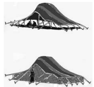
Berber Tent: Summer mode, open; Winter mode, closed.

Then in winter, the wall curtains are dropped and reed mats are put over them to break the cold wind and to insulate a contracted living space. The family, instead of wandering freely, now crowds together. Neighbors can no longer peer inside nor can the family gaze out. Children are constantly underfoot. They make noise, screaming and hollering for attention as children everywhere do. They step into food being prepared on the floor for supper. In order to keep a semblance of order, grandmothers tell stories, reciting favorite ones over and over until the weather warms and the winds subside.